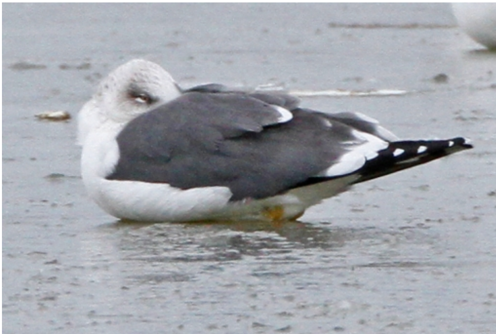
The first SBA record for Lesser Black-backed Gull occurred only recently, in 1989. The first multiple bird sighting of two was reported in 1998. The species is now encountered annually, often with multiple birds, and can be found at inland locations as well as along the coast of Saginaw Bay and Lake Huron. Roger Eriksson captured this fine study of an adult napping on the Saginaw River in Bay City this winter.