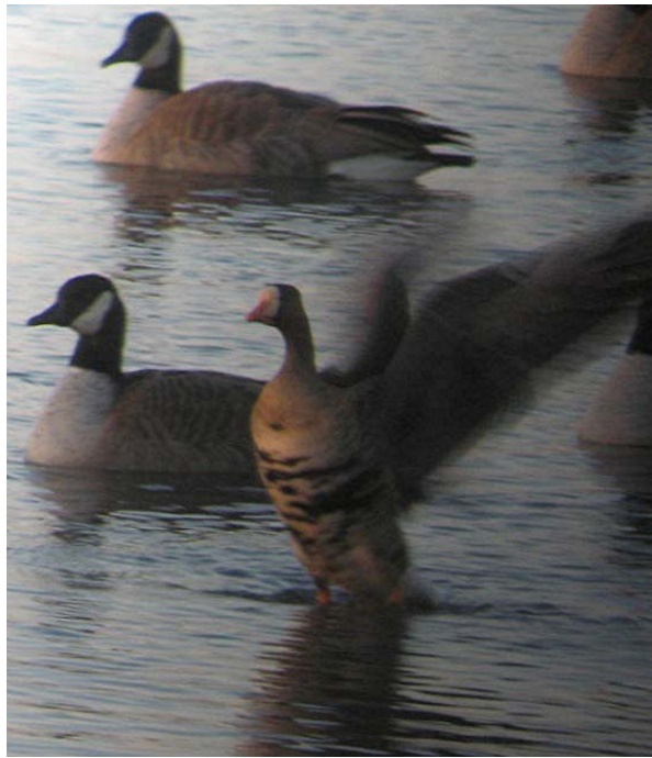
Joe Soehnel captured this image of a very handsome Greater White-fronted Goose showing off its (rarely so well seen) belly speckles at Port Austin, during the Huron County Christmas Bird Count.