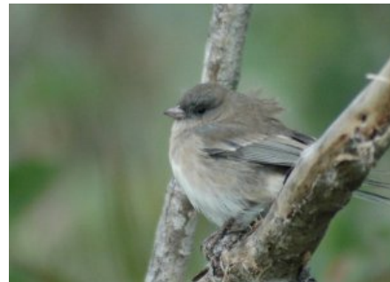
Dark-eyed Junco Taken 10/08/05 at Tawas Point, IO