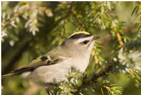
Golden-cr. Kinglet Taken 09/25/05 at Tawas Point, IO