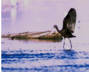
Ibis Sp. Taken 11/03/05 at Pinconning Pk, BA

(See the SBA Birding Photo Gallery at http://www.saginawbaybirding.org for a complete listing.)