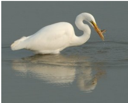
Great Egret Taken 10/22/05 at SNWR, SA