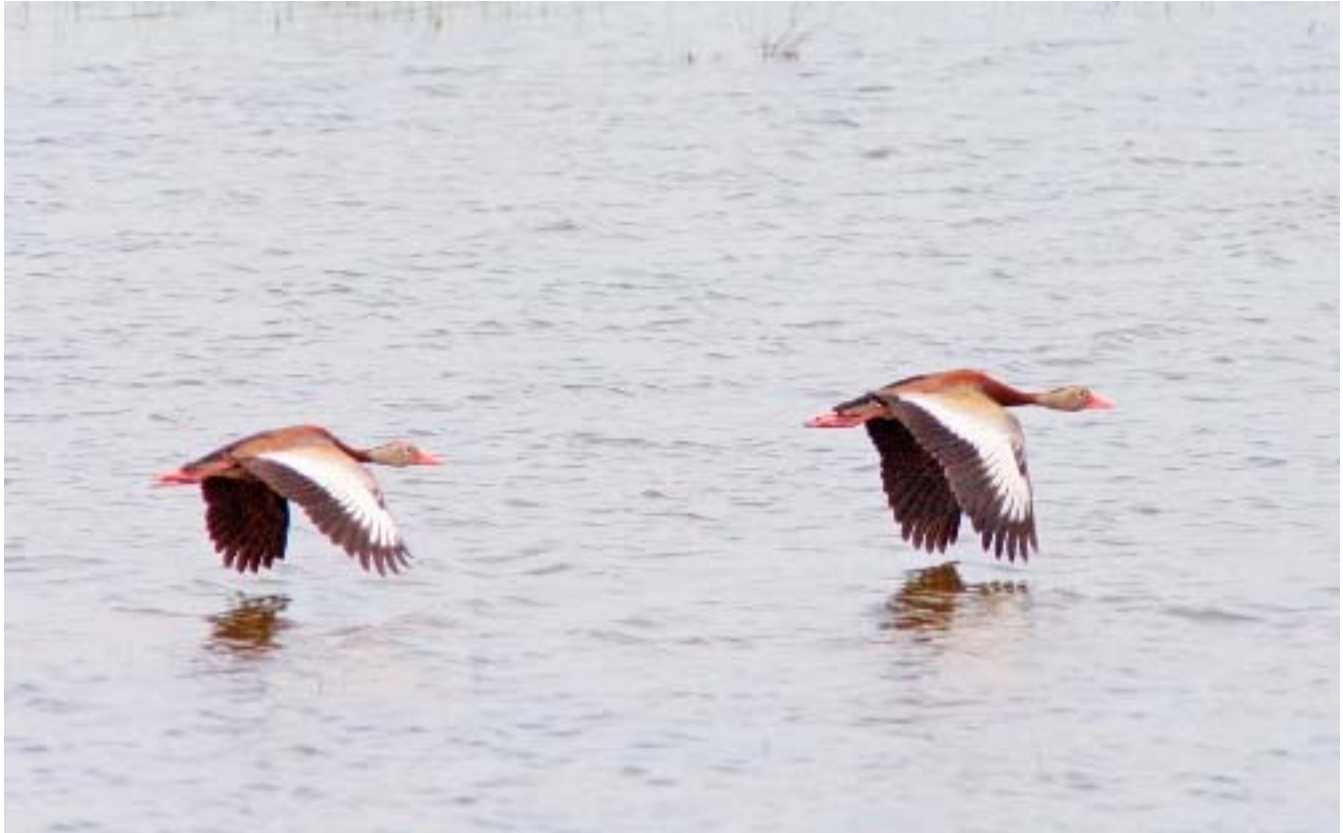
Black-bellied Whistling Ducks at Tawas Point State Park, Io June 4, 2014