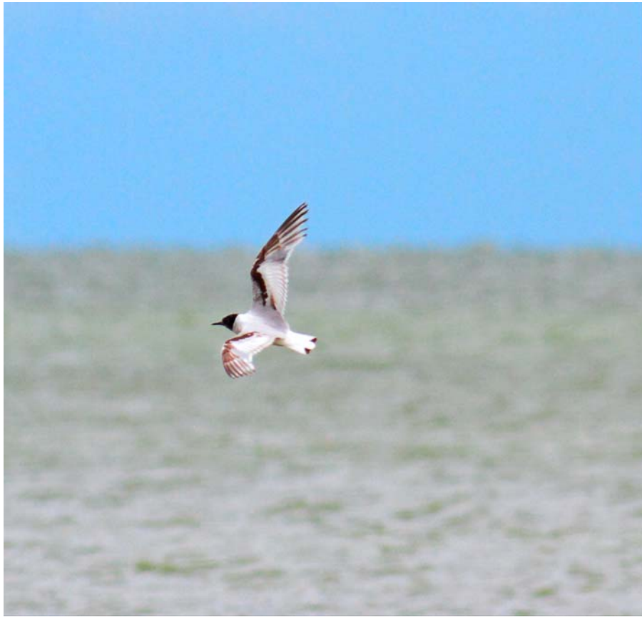
Little Gull at Kawkawlin Twp., Ba on June 26, 2014 First summer age.