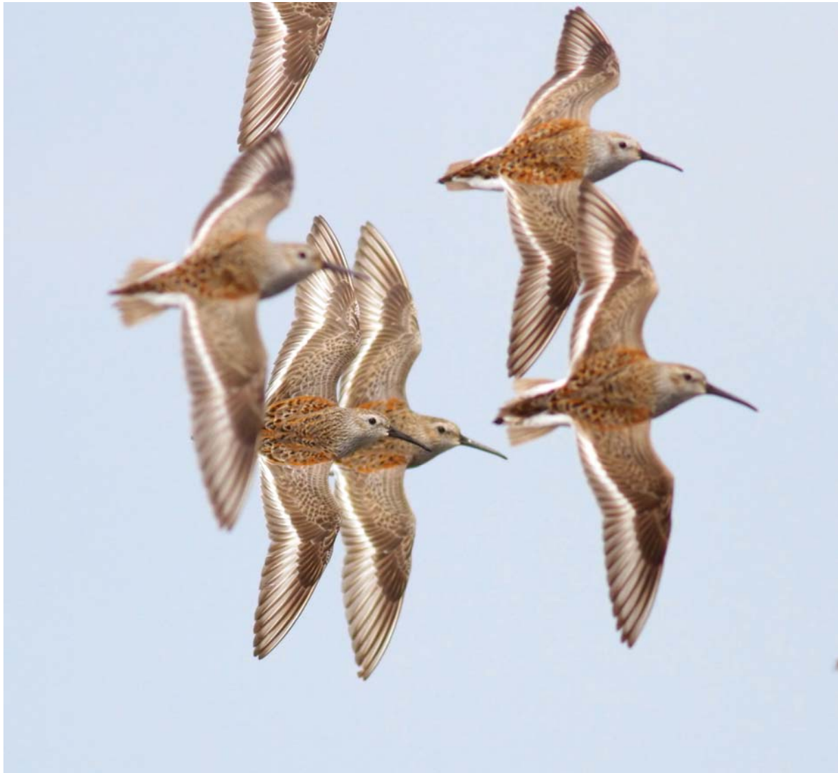
While its former common name, Red-Backed Sandpiper, was less creative than the Dunlin's current name, it was spot-on descriptive. Image by an Dan Duso, Fish Point State Wildlife Area, Tu.