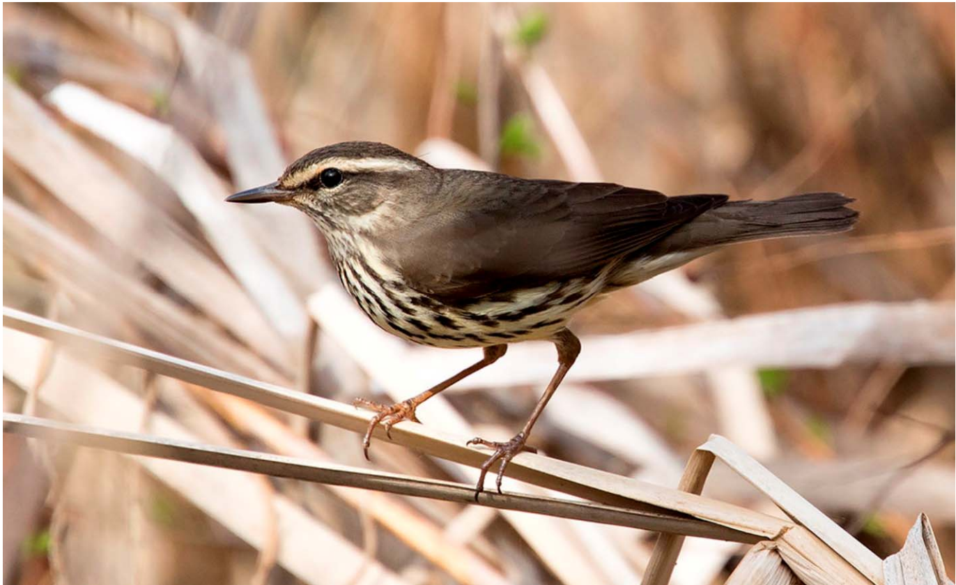
What would early May in dense, shady, wet, woody shrub-lands of the SBA be without the song of the Northern Waterthrush?