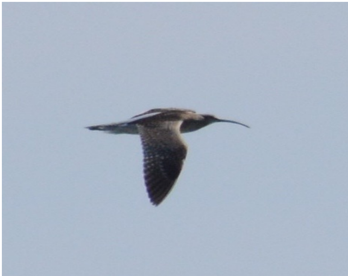
A Whimbrel with white back and rump plumage was sighted at Tawas Point, lo on May 17, and Glenn Peterson captured this image. This pattern is found on both the nominate phaeopus race and the alboaxillaris race, but not the hudsonicus race that breeds in Canada and Alaska and passes through TPSP, lo in migration. Glenn wrote that images taken by others show the bird had white underwings, indicative of phaeopus .