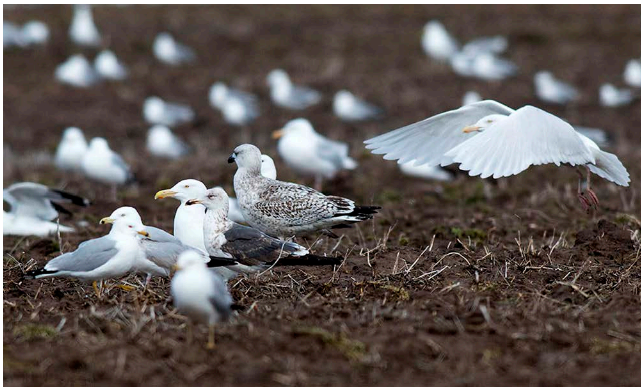
Five of the seven gull species recorded in the Saginaw Bay Area this spring are captured in one image, taken by Doug Jackson on April 11, in Pinconning Twp., Ba.