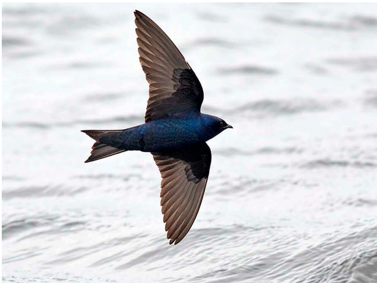
You couldn't ask for a finer study of a Purple Martin than at Nayanqing Point State Wildlife Area, Ba.