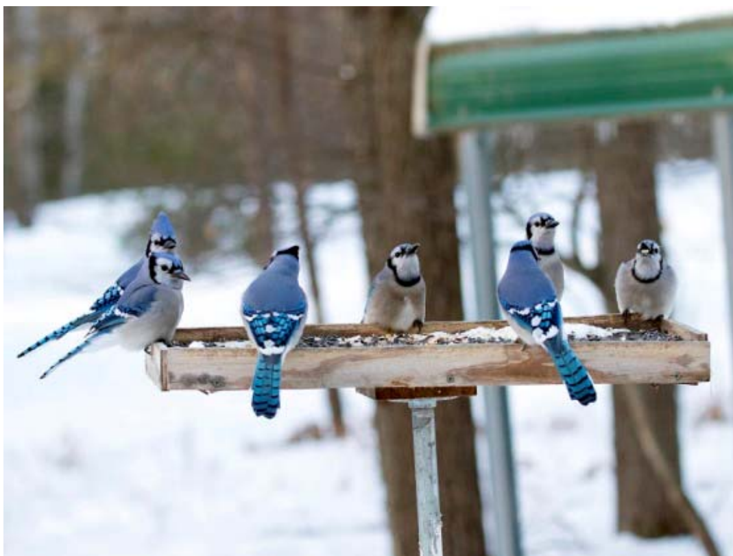
Large flocks of Blue Jays roamed the northern woodlands of the SBA this season. Doug Jackson captured their spectacular plumage from all angles in this image from Forest Lake, Arenac.