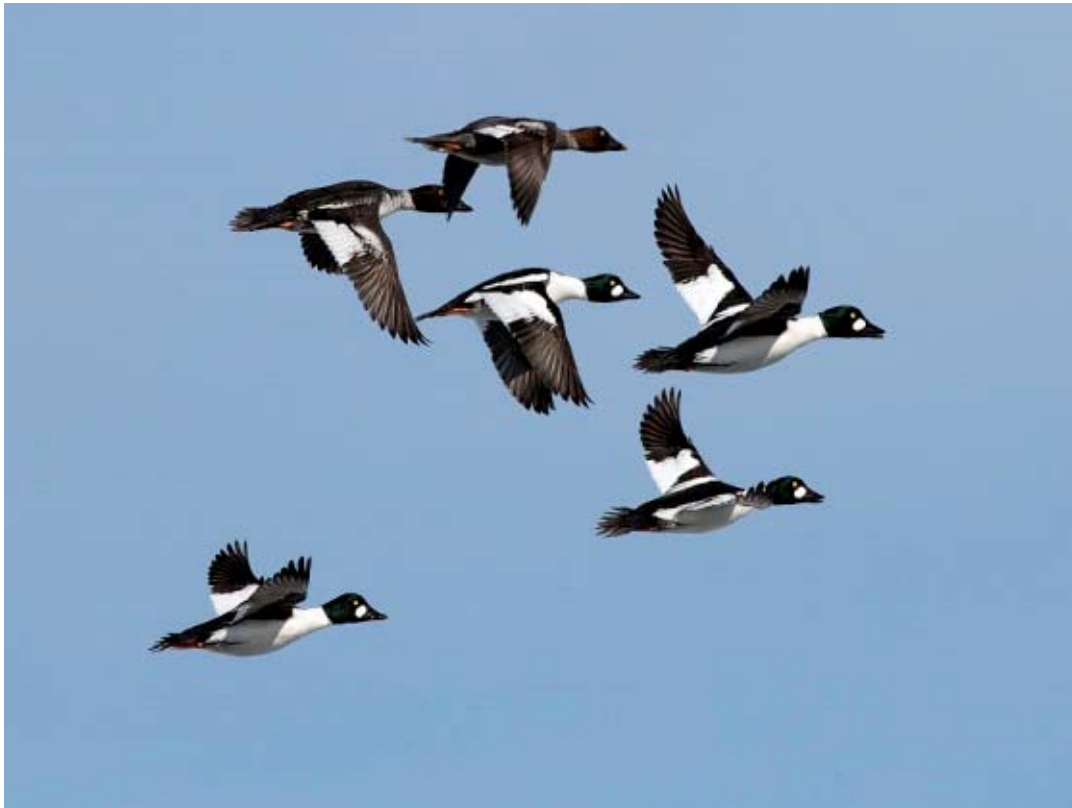
The prolonged period of sub-freezing temperatures in the last two-thirds of the season resulted in freeze-up of all waters not influenced by dams or warm water outflows. Waterfowl remaining throughout the winter were concentrated at these locations, such as these Common Goldeneye imaged at the AuSable River.