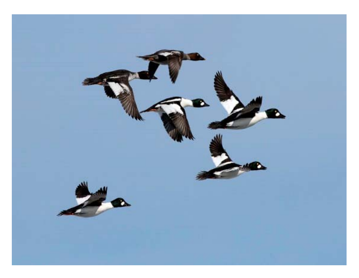
The prolonged period of sub-freezing temperatures in the last two-thirds of the season resulted in freeze-up of all waters not influenced by dams or warm water outflows. Waterfowl remaining throughout the winter were concentrated at these locations, such as these Common Goldeneye imaged at the AuSable River by Doug Jackson.