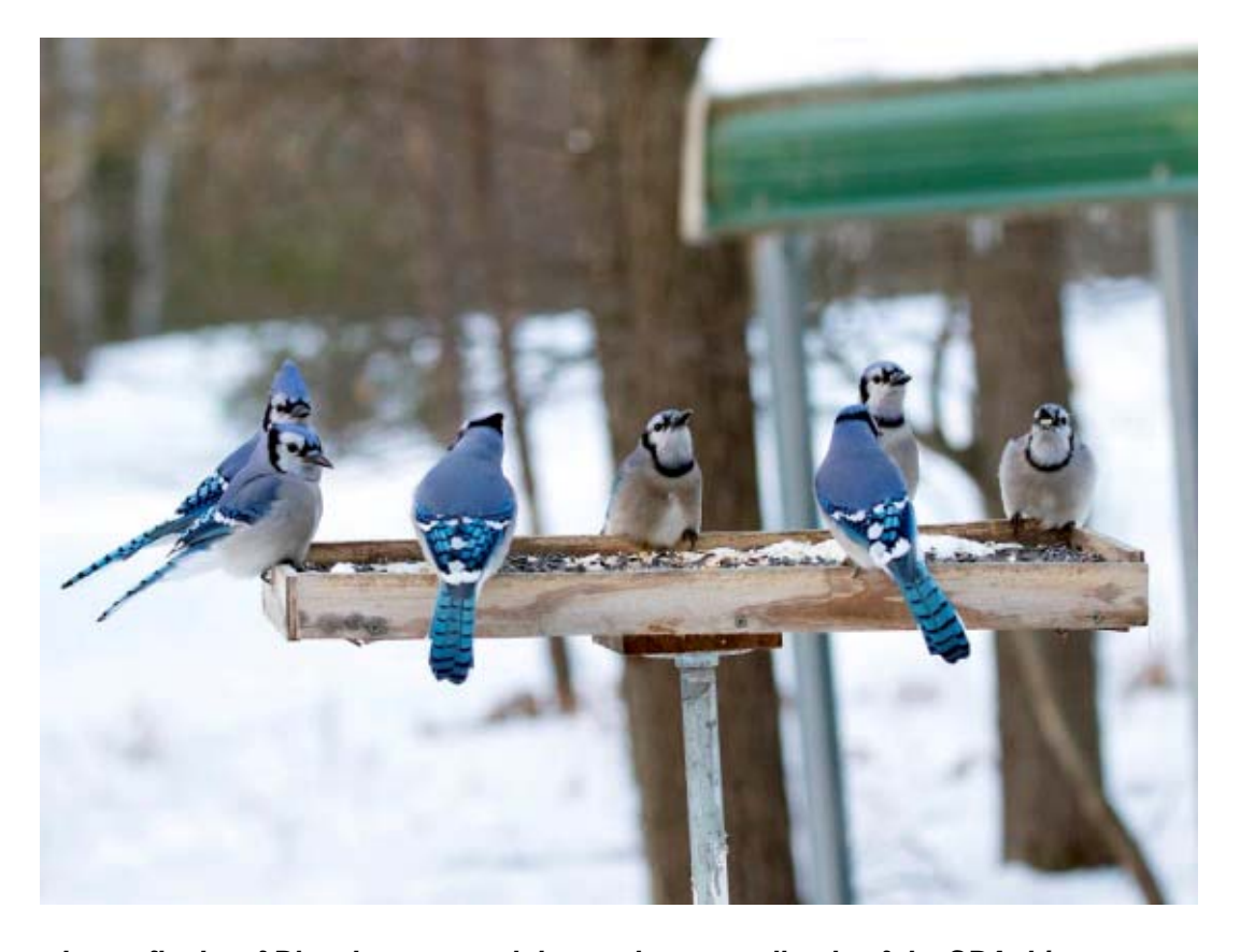
Large flocks of Blue Jays roamed the northern woodlands of the SBA this season. Doug Jackson captured their spectacular plumage from all angles in this image from Forest Lake, Arenac.