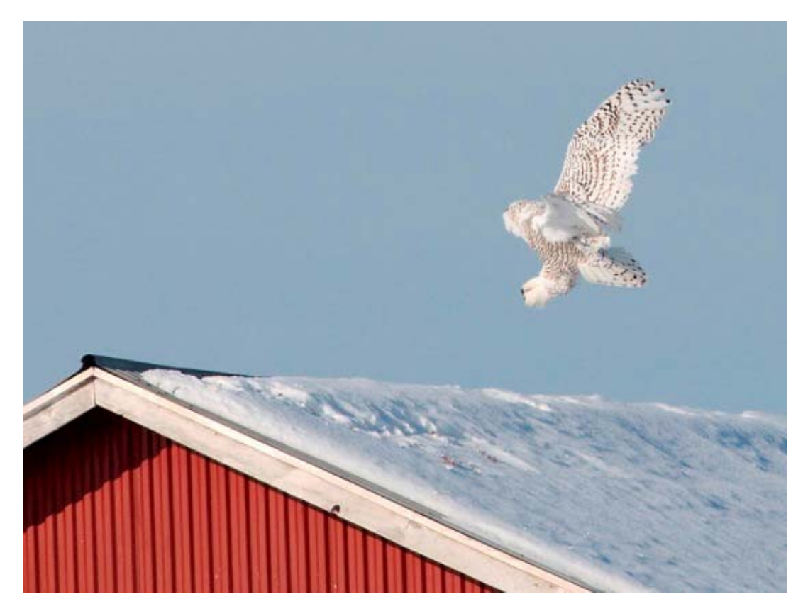
Snowy Owls were reported from all SBA counties this winter. Doug Jackson's talent for capturing images of birds in-flight affords us an opportunity to study feathered attributes of the species not visible when perched.