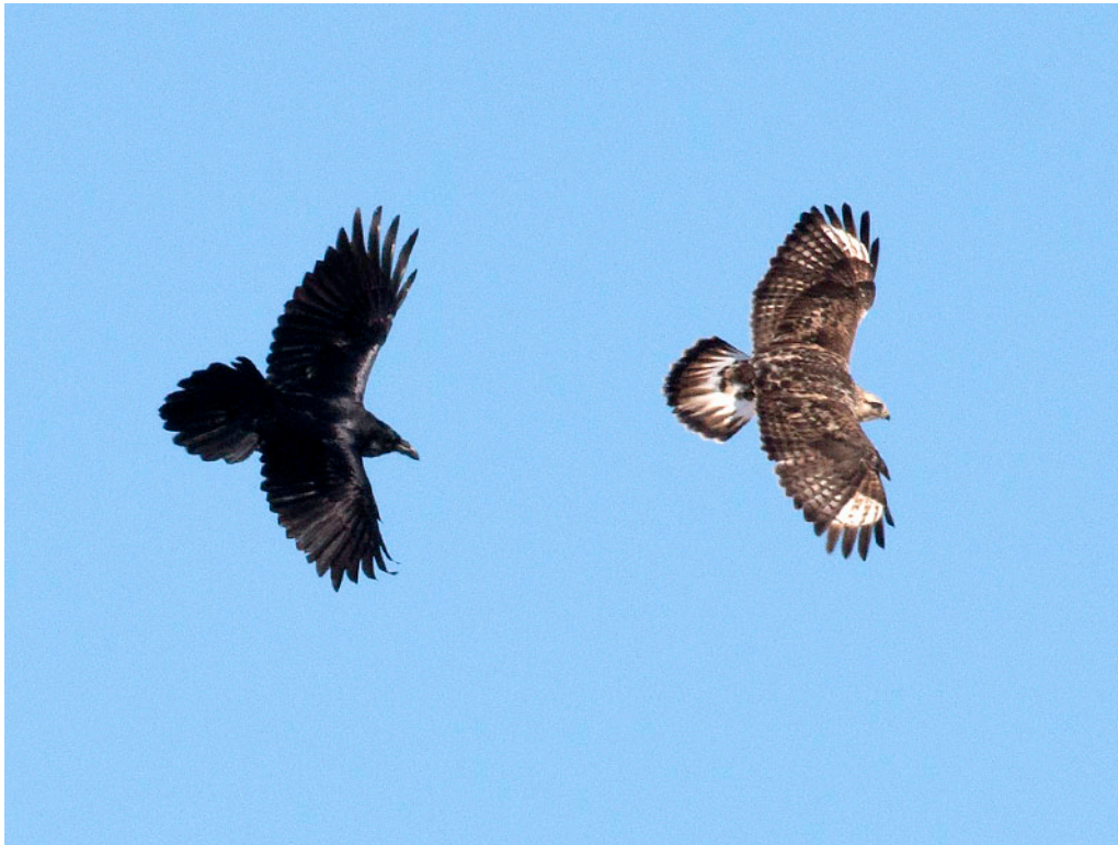
Doug Jackson continues to build a remarkable catalogue of images illustrating birds on the wing. An in-flight shot by Doug of either a Common Raven or a Rough-legged Hawk, with wing and tail feathers fully spread, is special in and of itself, but posed thus together beak to tail...spectacular.