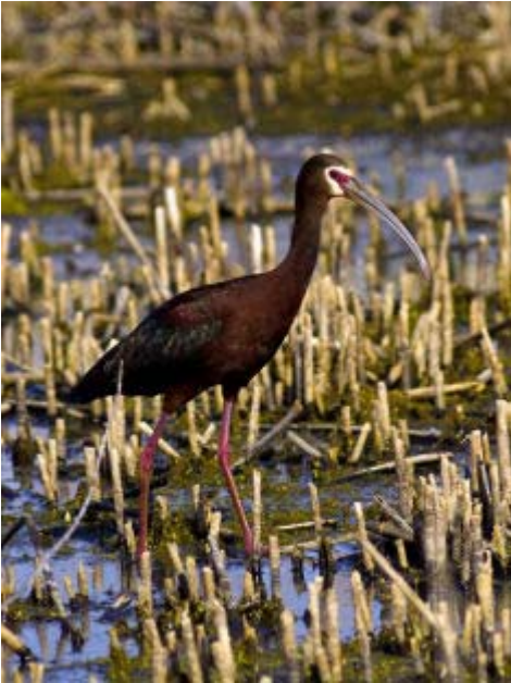
White-faced Ibis by: Doug Jackson Taken 05/21/09 at Fish Point SWA, Tu

A special thanks to the talented photographers of birds in the SBA, who generously shared their images from this past spring. The three photos on this page are only a sample; many more can be viewed at http://www.saginawbaybirding.org .