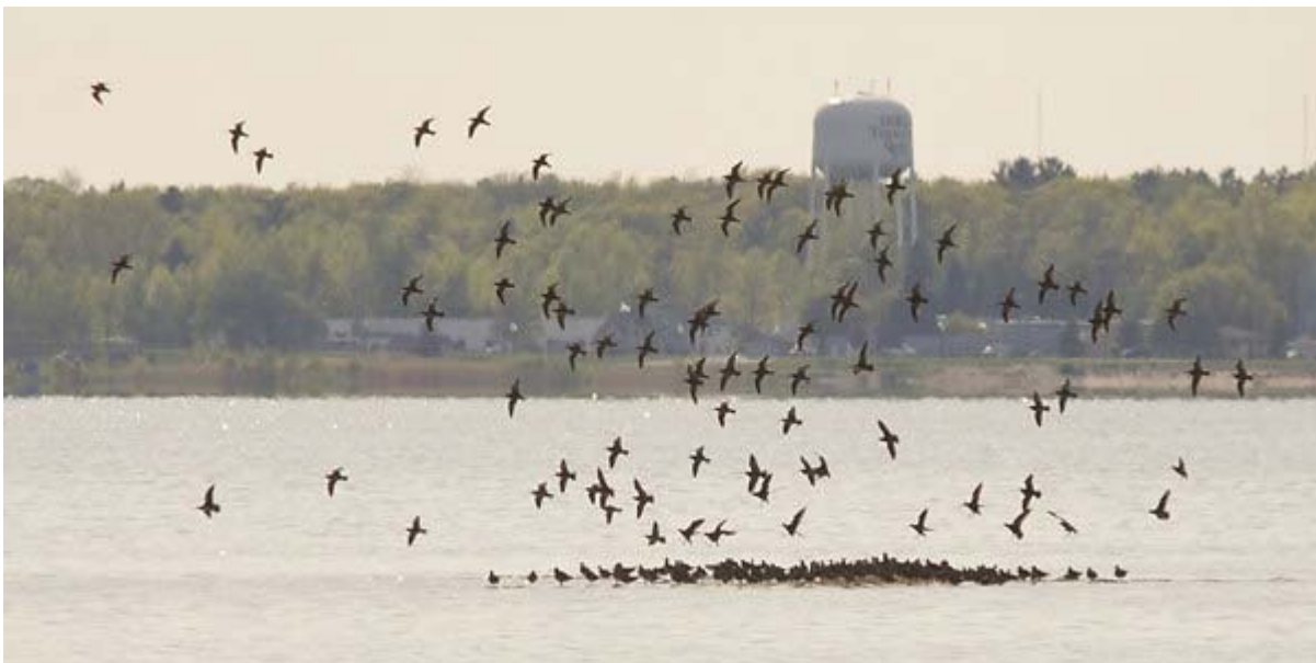
Whimbrels Taken 05/22/09 at Tawas Point State Park, Io