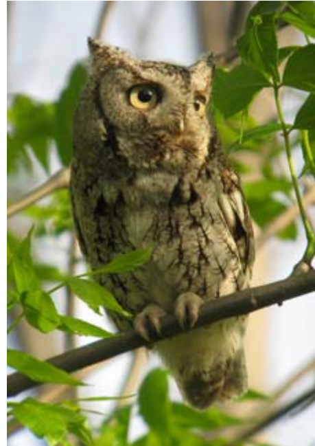
Eastern Screech-owl Taken 05/19/09 in Hampton Twp., Ba