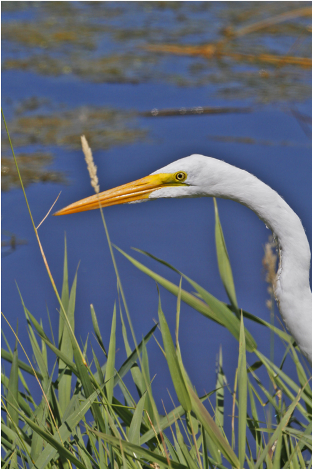
Great Egret represented a most notable species in the SBA this summer, not for reasons of rarity, but for an unprecedented and inexplicable abundance at Shiawassee NWR. July 25, 2013