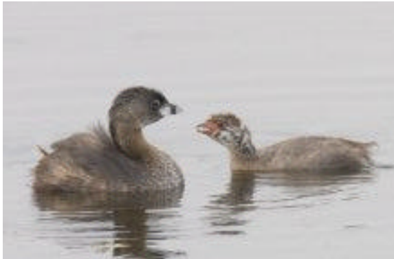
Pied-billed Grebes @ Tuttle Marsh on 7/17/05