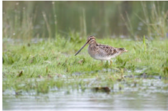
Wilson's Snipe in Tawas Area on 7/16/05