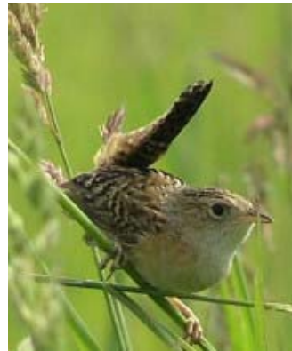
Sedge Wren at SNWR, SA on 07/15/06