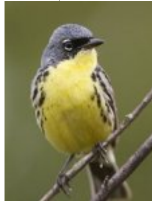
Kirtland's Warbler in north central Iosco Co. on 06/30/06

Look for this report (graphs/photos in color) at http://www.saginawbaybirding.org along with a "heads up" on autumn records in the Saginaw Bay Area as they are reported to me at soehnelj@hotmail.com or by calling at 517-892-3687. The complete SBA Bird Photo Gallery is also on the saginawbaybirding.org website.