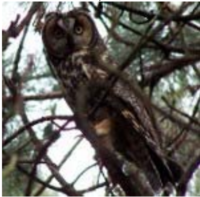
Long-eared Owl in southwest Midland Co, June, '06