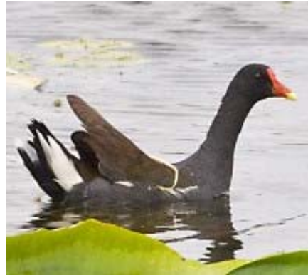
Common Moorhen at Nayanquing Point, BA on 07/29/06