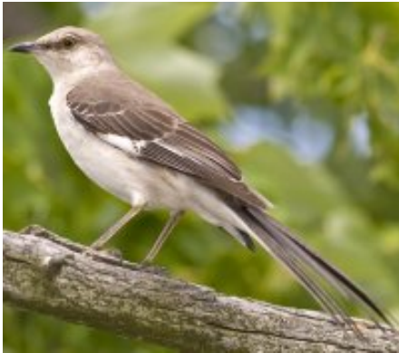
Northern Mockingbird at Tawas Point, IO on 06/22/06