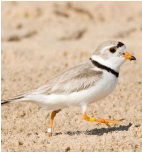
Piping Plover - Lake Huron Shore, Iosco Co June 29, 2007