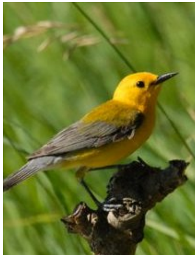
Prothonotary Warbler - SNWR, Saginaw Co, June 30, 2006