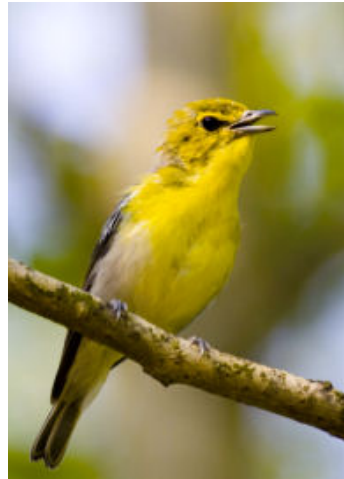
Yellow-throated Vireo – Mills Twp, Midland Co. July 25, 2007