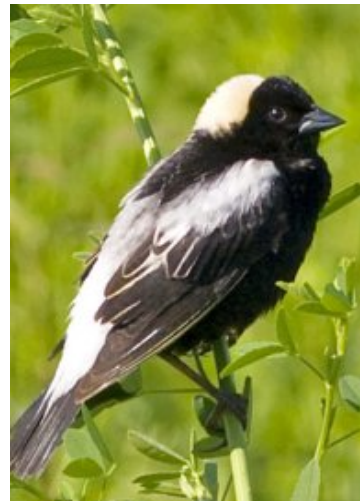
Bobolink - Chippewa NC, Midland Co., June 6, 2007

Look for this report at http://www.saginawbaybirding.org along with a "heads up" on autumn records in the Saginaw Bay Area as they are reported to me at soehnelj@hotmail.com .