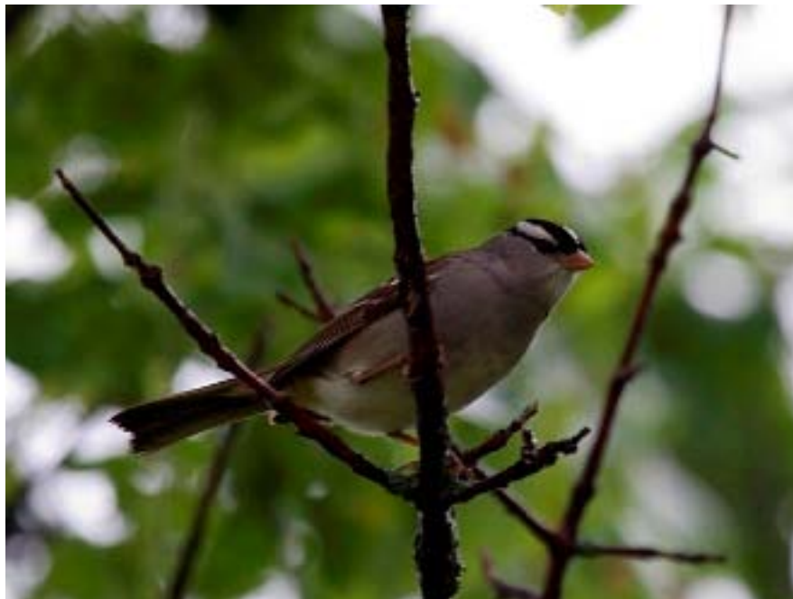
White-crowned Sparrow taken 06/08/2009 at Pinconning Township, Ba