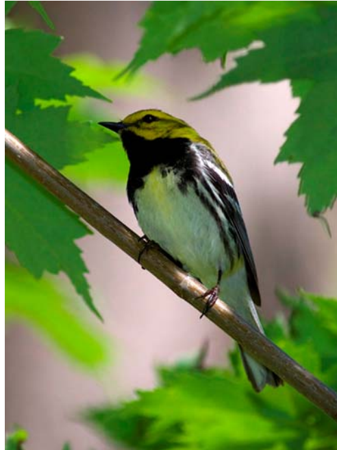
Black-throated Green Warbler Taken 06/12/2009 at Arenac County Park, Ar