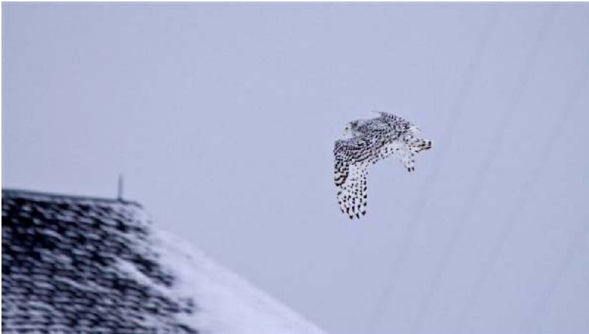
Snowy Owl 01/09/09 at Dutcher Rd., Tu