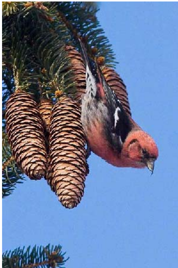
White-winged Crossbill 1/15/09 at New St. Patrick's Cemetery, Bay City, Ba