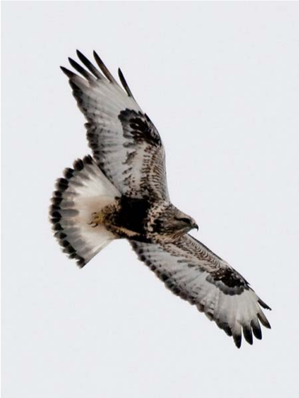
Rough-legged Hawk 2/1/10 at Sterling, Ar